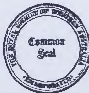
Figure 4. Imprint made from the "Common" or Presidential Seal of the Royal Society of Western Australia.